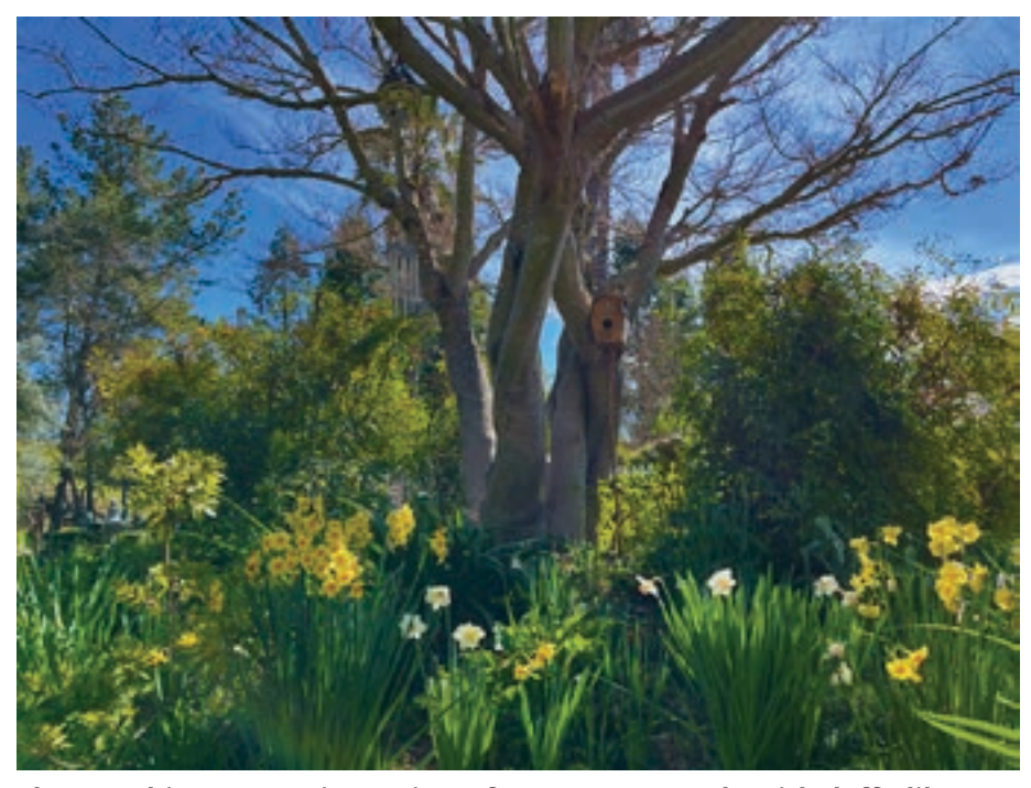
The sun shines on a winter view of a Japanese maple with daffodils atthe base.